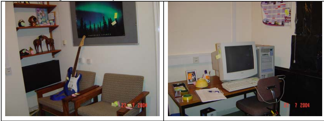
Fig. 1. Real-world experimental space after completion of object arrangement task