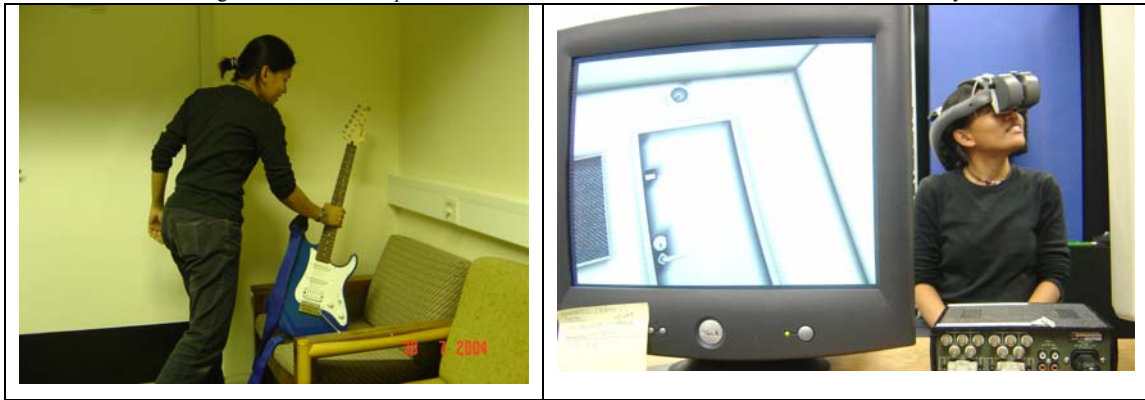
Fig. 3. Arrangement task in the physical room (left) after training in the synthetic room (right)