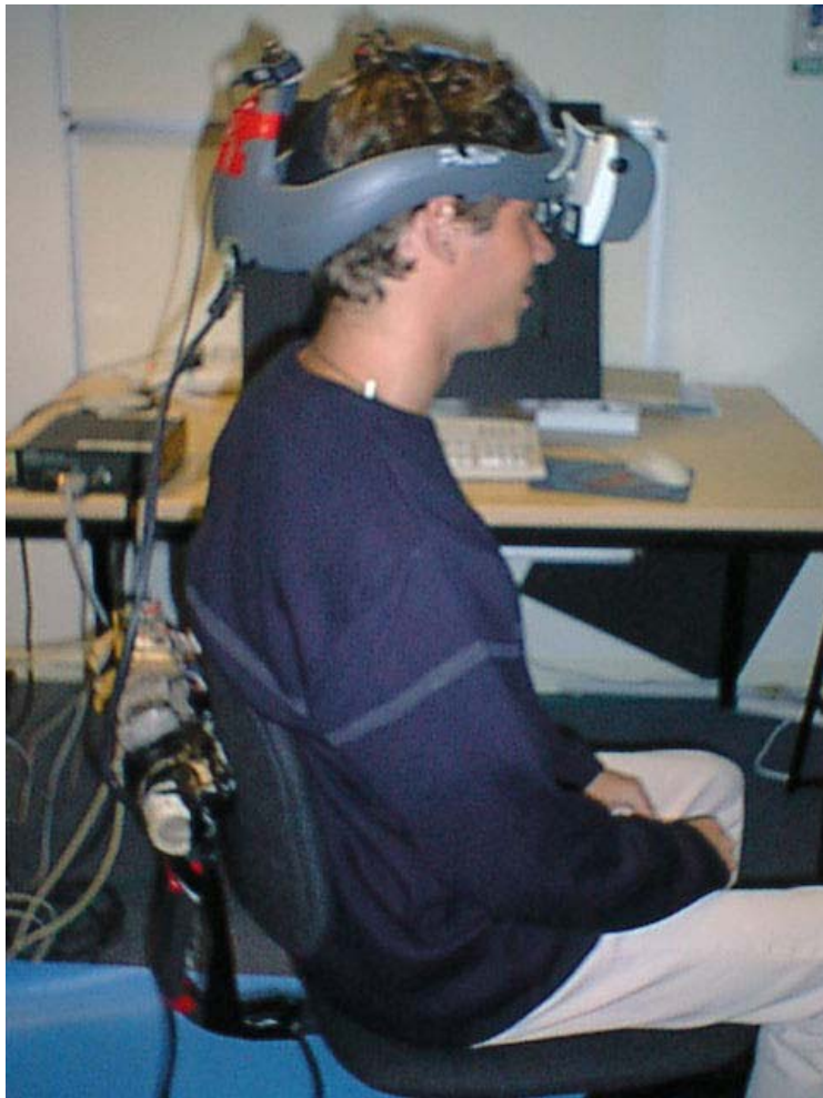
Figure 4: The real-world and HMD mono/stereo condition (head-tracked).