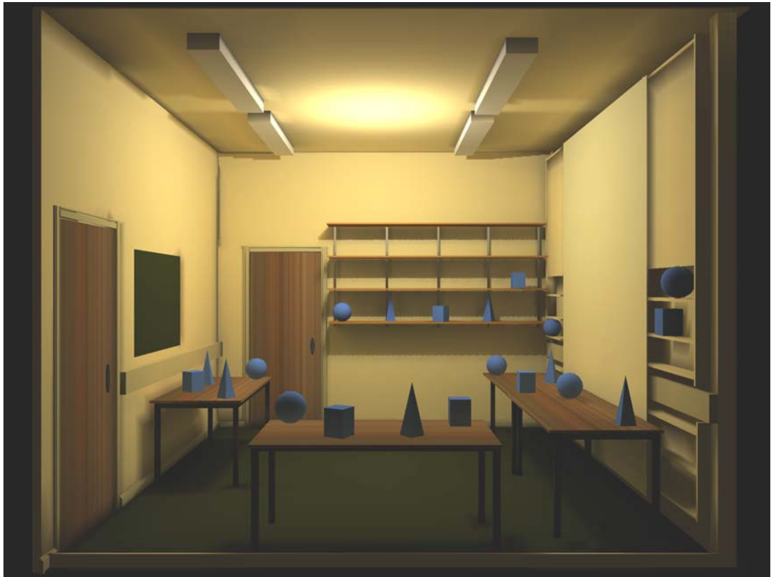
Figure 2: The radiosity rendering.