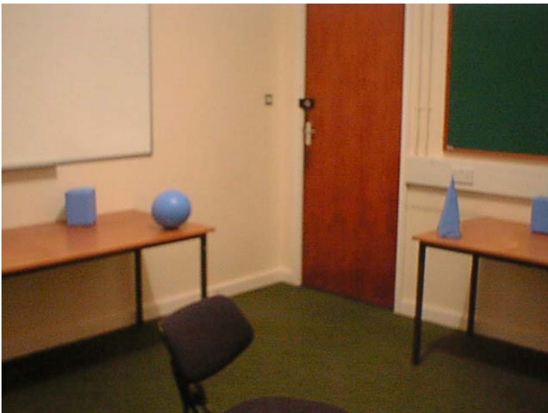
Figure 1: The real world room (real-world condition).