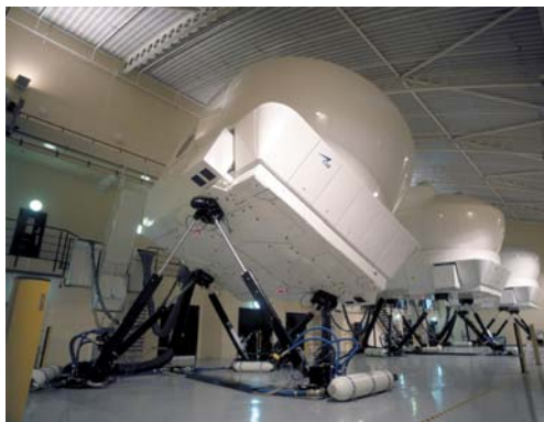
Figure 3. A Full Flight Simulator.