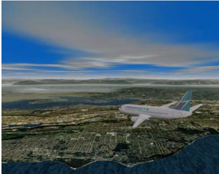
Figure 9. Cloud layer indicating a possible inversion (courtesy of CAE).

The ability to render and display such phenomenon is of course only part of the problem. Such accurate effects take a considerable amount of time to model, which again leads to increased cost and a less than desirable flexibility. Modeling tools must be developed that enable these conditions to be created efficiently to reduce the workload of the modeler and enable more rapid and flexible model development.