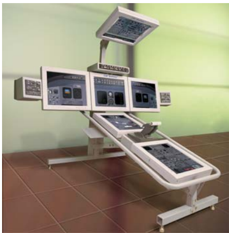
Figure 2. Airbus A320 'simfinity' Flight Training Device (Courtesy of CAE).