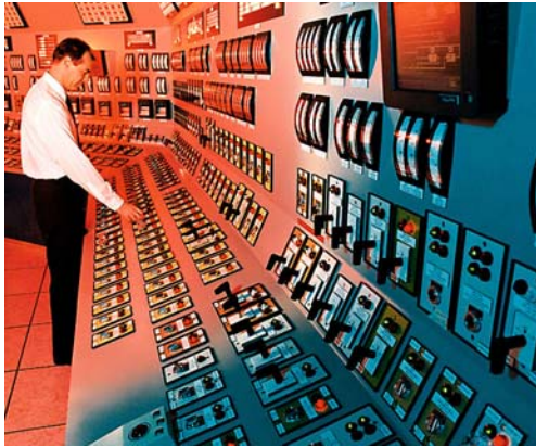
Figure 1. Krsko Power Plant Simulator.