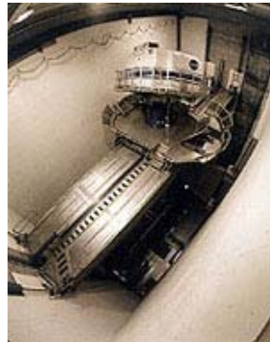
Figure 7. The NASA VMS system

significant effects that cannot be simulated in such a fashion. At a load of 5G for example the pilot will feel as if he weighs 5 times more than he normally does, and will almost certainly be experiencing additional grey out effects such as a mild inability to focus on operational tasks and may be finding it difficult to interpret information being relayed via the avionic displays due to the lack of oxygen. If these effects could also be simulated, then the overall training value for fast jet simulation would increase dramatically (though clearly rendering a pilot unconscious would be undesirable). This would be a significant challenge indeed since the only way to simulate the full spectrum of high G loading effects is to reproduce the motion and velocities involved, and while certain approaches have been taken in the past the Vertical Motion Simulator (VMS) at NASA Ames Research Centre in California (Figure 7) is the only one which is operational, and this is used for research rather than operational training [Nasa Ames 2003]. Indeed the sheer cost, complexity and size of systems such as the VMS may make them economically unviable for mass training, and are only likely to be developed should it become a requirement within the specification of future simulators.