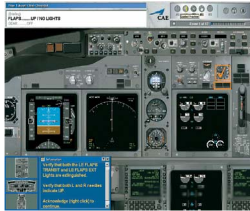
Figure 4. Low fidelity 'Simfinity' training application.

This clearly leads to increased mission success and survivability. A significant challenge for the development of these systems however lies in the nature of the recreation of the avionics display which in itself stems from the portability. In a high fidelity simulator utilising actual avionics, only the data input needs to be synthesised. Within these portable devices however the actual avionic display must also be created, clearly within limited screen space, especially with a single display device. The nature of interaction will also be synthetic and unnatural. While this is unavoidable to the greatest extent, careful application of Human Computer Interaction practices is vital. With the advent and pervasiveness of high bandwidth communication it is also possible that these devices (as well as their high fidelity counterparts) may be interconnected, either across buildings or globally, to create a virtual training scenario regardless of trainee location.