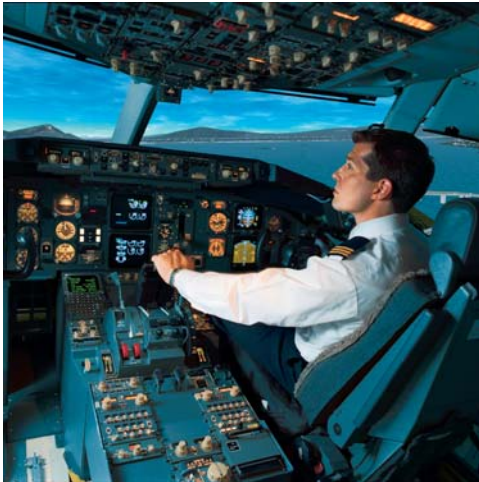
Figure 5. A simulated Boeing 737 flight deck with level D visual.

Such devices are employed to provide clear outside view during low visibility or hazardous conditions. Clearly within a real environment the data that is displayed from such devices is simply dependant upon sensor information – the outside environment is really there and can be measured and displayed. Within a simulator however the environment is virtual, and cannot be measured with FLIR or MMW. The low visibility image must therefore be created from the visual scene, adjusted to be displayed from the point of view of the sensor (which will be different from the pilots eye point), and displayed within the cockpit. Recent advances within visual image generator (IG) design provide for this particular example as shown in Figure 6.