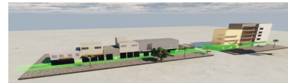
Figure 2. Translation of 1866 Square at Chania (Greece) to music